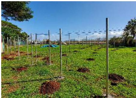
Beginning of construction

The previous Agility yard at Maui Humane Society underwent renovations in January. The new Canine Visiting yards, when completed, will provide 10 large spaces for visitors to view dogs out in “Day Groups.” There will also be new spaces to visit dogs, allowing for better engagement and interactions. Having these outdoor Day Groups gets dogs out of their kennels for enrichment activities and better supports their natural, species-specific behaviors, improving their mental health. The Animal Care & Enrichment (ACE) Team matches dogs based on personality and oversees this out-of-kennel time. The initial goal is for dogs to spend at least two hours out of the kennel each day, extending over time to six hours each day. Another focus of building more exercise yards was to create low-stress areas for the public to walk through and interact with and spend time with the dogs.