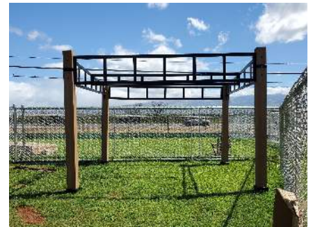
Gazebos for shade (in progress)