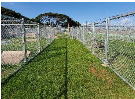
10 new dog play yards