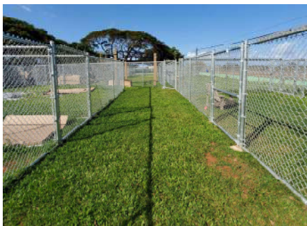
10 new dog play yards