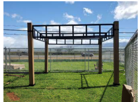
Gazebos for shade (in progress)