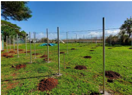
Beginning of construction

The previous Agility yard at Maui Humane Society underwent renovations in January. The new Canine Visiting yards, when completed, will provide 10 large spaces for visitors to view dogs out in “Day Groups.” There will also be new spaces to visit dogs, allowing for better engagement and interactions. Having these outdoor Day Groups gets dogs out of their kennels for enrichment activities and better supports their natural, species-specific behaviors, improving their mental health. The Animal Care & Enrichment (ACE) Team matches dogs based on personality and oversees this out-of-kennel time. The initial goal is for dogs to spend at least two hours out of the kennel each day, extending over time to six hours each day. Another focus of building more exercise yards was to create low-stress areas for the public to walk through and interact with and spend time with the dogs.