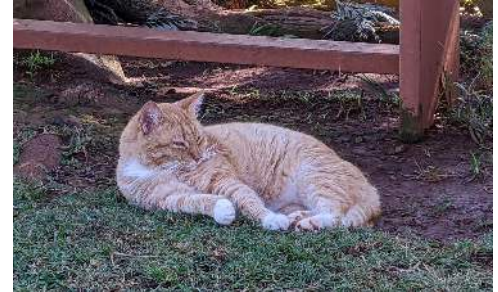
Lahaina Fire Cat "Launiupoko" settling in at the Lanai Cat Sanctuary

On a personal note, I had the honor of serving as Lanai Cat Sanctuary's first veterinarian 12 years ago, back when there were just 375 cats living there (there are now close to 900). It's an incredibly special place, not only in my heart, but as a model sanctuary across the islands, the nation, and the world. If you haven't been there for a visit, you must. There is no place like it. Working there changed my life. It's where I discovered that my passion is to serve the animals who don't have a home, a voice, or an advocate. That's when I began the journey that has led me here today. To work with LCS again after all these years, and to be able to save hundreds of innocent lives, is what I wake up for every day. We are so very fortunate to have Lanai Cat Sanctuary nearby, as a safe haven for the Lahaina fire cats, and as a model for the rest of the world.